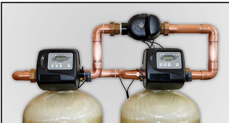
EXAMPLE OF A TWIN CONFIGURATION