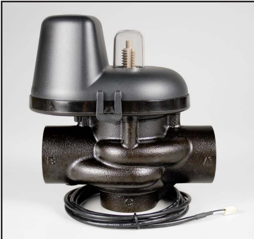
Order No. V3071 • NPT Order No. V3071BSPT • BSPT